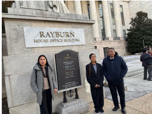
Speakers in front of the Rayburn House Office Building in Washington, D.C.