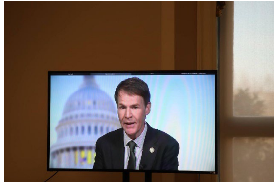
Rep. Jefferson Shreve (R, IN-6) giving his remarks