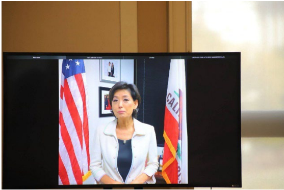
Rep. Young Kim (R, CA-40) giving her remarks