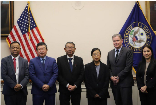
Speakers and Panelists