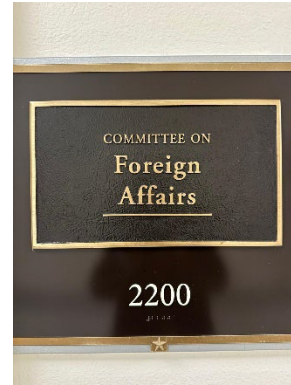
The Briefing room inside the Rayburn House Office Building

The Burma Research Institute (BRI) is a 501(c)(3) nonprofit organization based in Ellicott City, Maryland, United States that conducts research and advocacy. BRI primarily focuses on freedom of religion or belief, human rights, and protection and assistance of refugees and internally displaced people in Burma. Formerly known as the Chin Association of Maryland, BRI also empowers the local Chin community in Maryland and across the United States to successfully integrate into American society. ( www.burmari.org ). ###