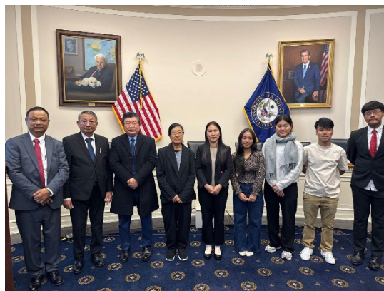
Speakers and BRI volunteers