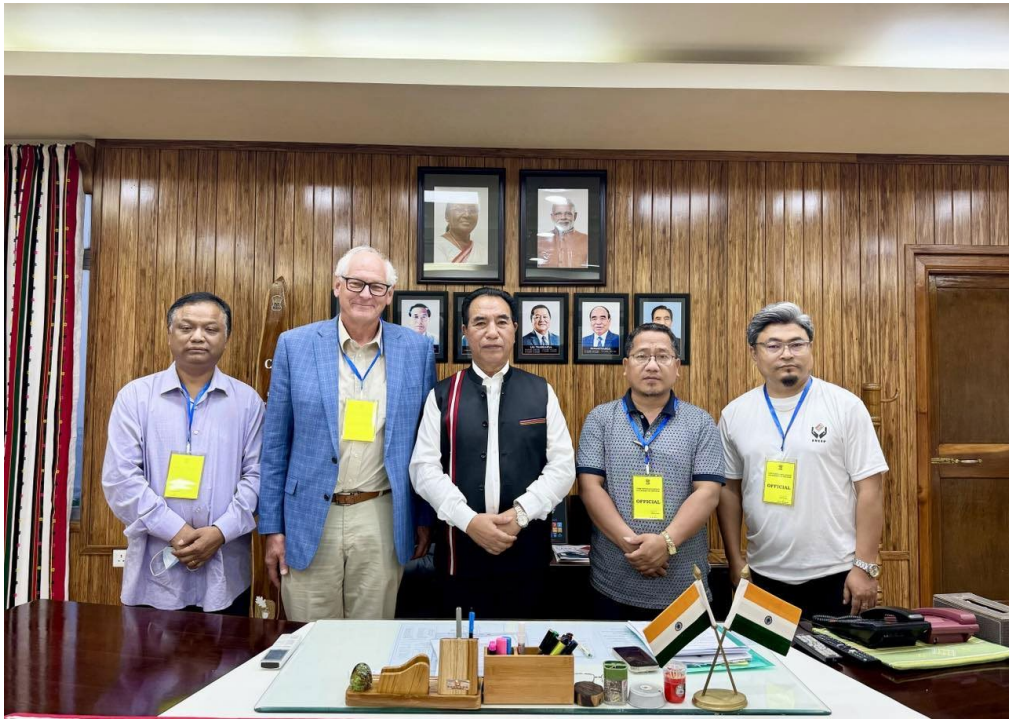
CAM with Mizoram Chief Minister Lalduhoma, April 2024.