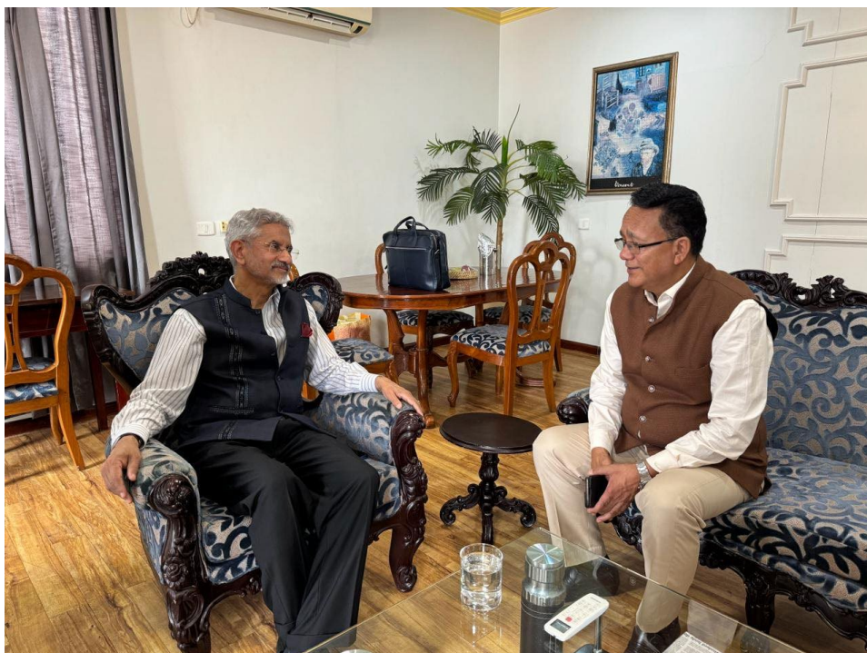
Former Speaker Sailo meeting with External Affairs Minister S. Jaishankar, April 2024.